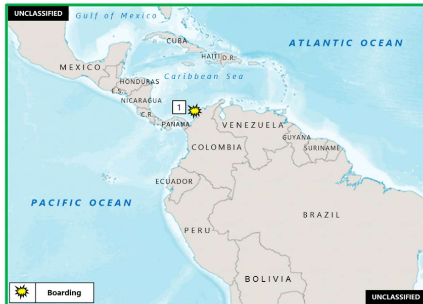
Figure 1. (U) Central America – Caribbean – South America Piracy and Armed Robbery at Sea

1. (U) COLOMBIA: On 19 January at 0040 local time, three perpetrators boarded a container ship underway approximately 20.5 NM southwest of Cartagena near position 10:12N – 075:50W. After the crew spotted the perpetrators, the ship's alarm was raised, the crew mustered, and the Colombian Coast Guard was notified. The perpetrators escaped in their boat. The coast guard escorted the vessel to its berth and subsequently boarded the vessel to conduct an investigation. All crew were reported safe. (Clearwater Dynamics; IMB)