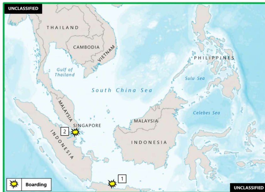
Figure 2. (U) East Asia – Southeast Asia Piracy and Armed Robbery at Sea

1. INDONESIA: On 26 January at 0215 local time, five perpetrators in a small boat approached and boarded a tanker anchored at Balongan Anchorage near position 06:14S – 108:25E. Duty crew discovered one of the perpetrators on the poop deck assisting a second to board. The alarm was raised and the crew mustered. After being spotted, the perpetrators escaped in the waiting boat. The incident was reported to port control. All crew were reported as safe and nothing was reported stolen. (Clearwater Dynamics; IMB)