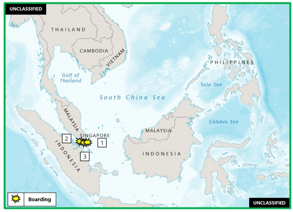
Figure 1. (U) East Asia – Southeast Asia Piracy and Armed Robbery at Sea

1. (U) INDONESIA: On 8 February at 1730 local time, an unknown number of robbers boarded a barge under tow by a Singapore-flagged tug while transiting the eastbound lane of the Singapore Strait Traffic Separation Scheme (TSS) near position 01:11N – 103:52E. The perpetrators stole scrap metal before escaping. The ship master reported all crew were safe and that the vessel did not require any assistance. The tug and barge continued their transit to Kuantan, Malaysia. (Clearwater Dynamics)