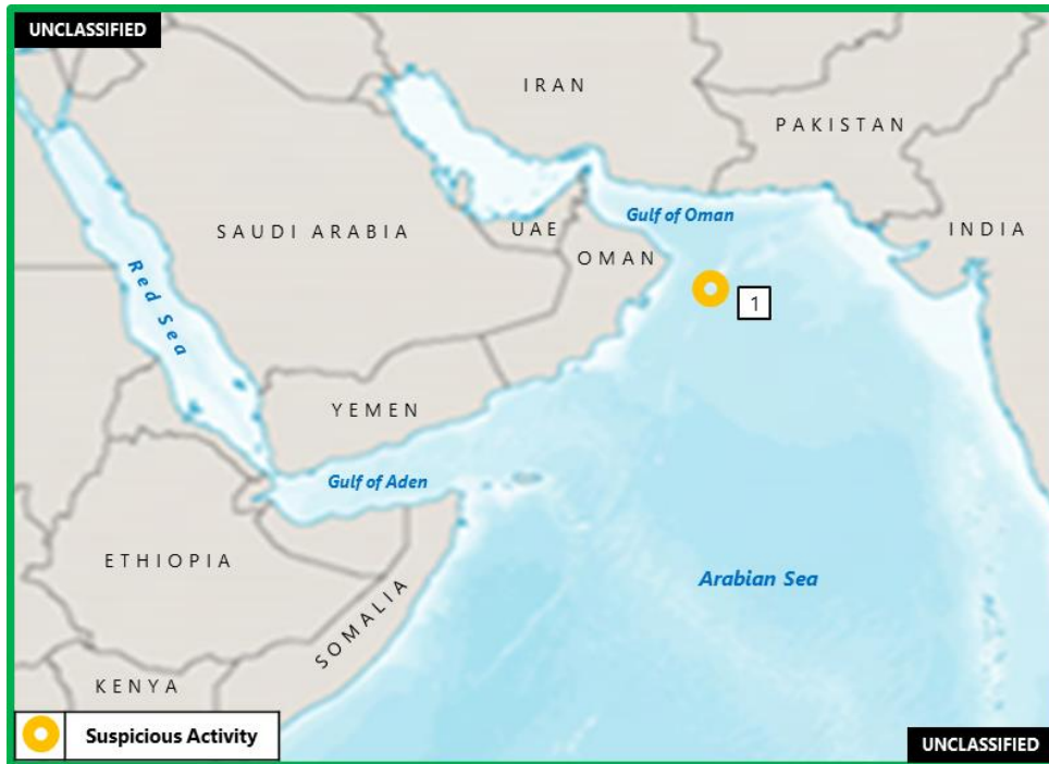
Figure 2. (U) Indian Ocean – East Africa – Red Sea Piracy and Armed Robbery at Sea

1. (U) ARABIAN SEA: On 10 February, an “airborne object” struck the underway Liberia-flagged tanker CAMPO SQUARE approximately 300 NM off the coast of Oman, near position 20:36N – 062:34E. The vessel suffered minor damage, no crew were harmed, and the vessel continued its voyage to Fujairah. (Clearwater Dynamics; Maritime Executive)