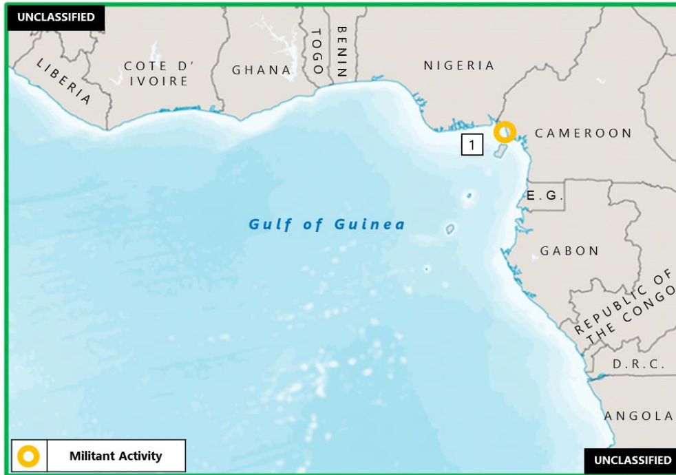
Figure 1. (U) West Africa – Gulf of Guinea Piracy and Armed Robbery at Sea

1. (U) CAMEROON: On 17 February, suspected militants reportedly fired upon and boarded an oil vessel anchored off the Idabato subdivision of the Bakassi Peninsula. Armed men boarded the vessel after shooting and killing two escorts. The perpetrators then attempted to set the vessel ablaze, escaping before Cameroonian forces arrived. (Clearwater Dynamics; Daily Post Nigeria)