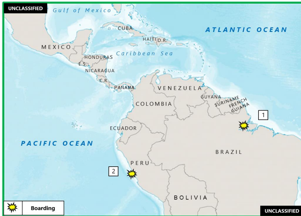
(U) Figure 1. Central America – Caribbean – South America Piracy and Armed Robbery at Sea

1. (U) BRAZIL: On 27 February at 2345 local time, five robbers armed with long knives boarded the anchored Cyprus-flagged bulk carrier BRIGITTE at Macapa Anchorage, near position 00:05N – 050:58W. The duty crew discovered the robbers close to the forecandle and notified the duty officer. The alarm was raised, the ship's horn sounded, and the crew mustered. Upon realizing they had been spotted, the robbers escaped with ship's properties. The master reported the incident to port control. (IMB; Clearwater Dynamics; vesseltracker.com)