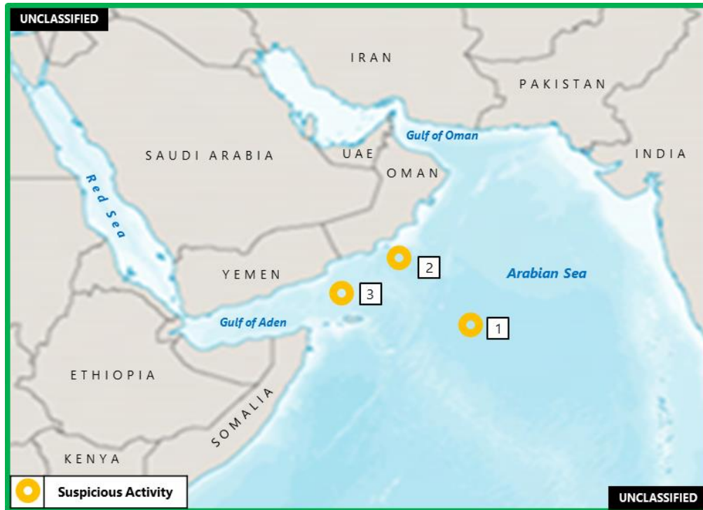
(U) Figure 3. Indian Ocean – East Africa – Red Sea Piracy and Armed Robbery at Sea

1. (U) ARABIAN SEA: On 2 March, the United Kingdom Maritime Trade Operations (UKMTO) received reports that an underway vessel was approached by two small crafts approximately 345 NM east of Socotra Island near position 12:24N – 060:19E. The two craft with white hulls approached to within 0.1 NM of the vessel. One craft had five persons onboard and the other craft had six persons onboard. Reporting also indicated that these crafts were being supported by a larger blue-hulled vessel. (UKMTO; Clearwater Dynamics)