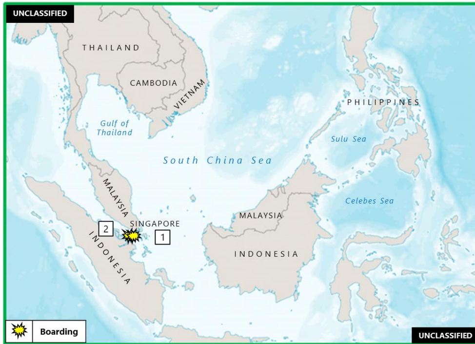
(U) Figure 4. East Asia – Southeast Asia Piracy and Armed Robbery at Sea

1. (U) INDONESIA: On 23 February at 0130 local time, six robbers armed with knives boarded the underway Panama-flagged bulk carrier LOWLANDS AMSTEL in the Singapore Strait, near position 01:08N – 103:29E, east of Little Karimun Island. Duty crew discovered the robbers near the engine room, where a standoff occurred with the engine crew. The robbers threw tools at the crew resulting in two crew members sustaining injuries. The master reported that the robbers had left the vessel and scrap metal had been stolen. The vessel did not require any assistance and continued its voyage to Singapore. (Clearwater Dynamics; ReCAAP)