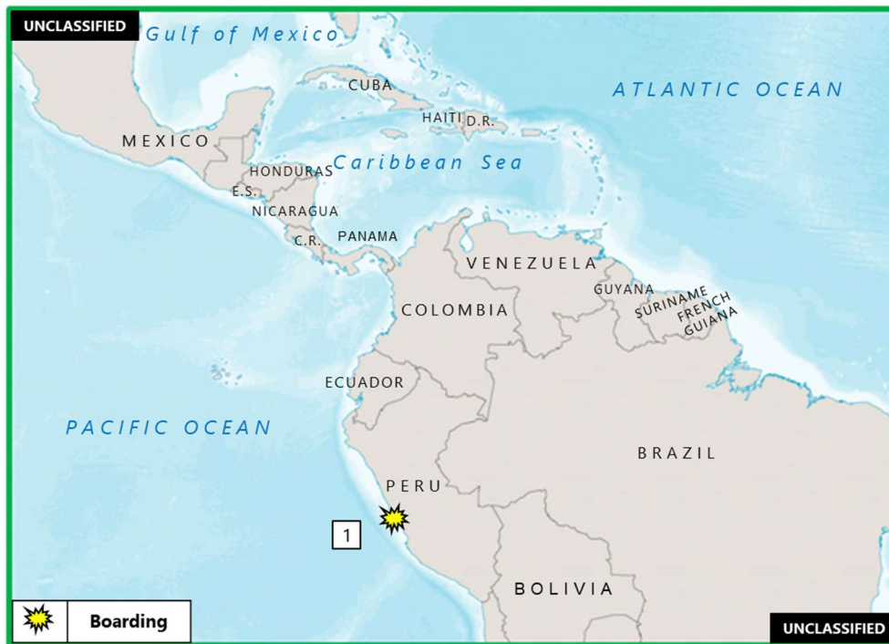
(U) Figure 1. Central America – Caribbean – South America Piracy and Armed Robbery at Sea

B. (U) CENTRAL AMERICA – CARIBBEAN – SOUTH AMERICA: