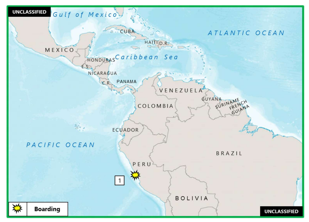
(U) Figure 1. Central America – Caribbean – South America Piracy and Armed Robbery at Sea

1. (U) PERU: On 23 September at 0330 local time, two perpetrators armed with knives boarded the anchored Bahamas-flagged LNG tanker MUREX at Callao Anchorage, near position 11:59S – 077:13W. The perpetrators boarded the vessel from a small boat with six persons onboard and gained access to the tanker by crawling in between the anchor chain and the hawsepipe cover, which they later removed. The perpetrators threw the securing bar from the hawsepipe cover at approaching duty crew, who raised the alarm, resulting in the perpetrators fleeing the vessel and escaping in the waiting boat. During a search of the vessel, the crew reported