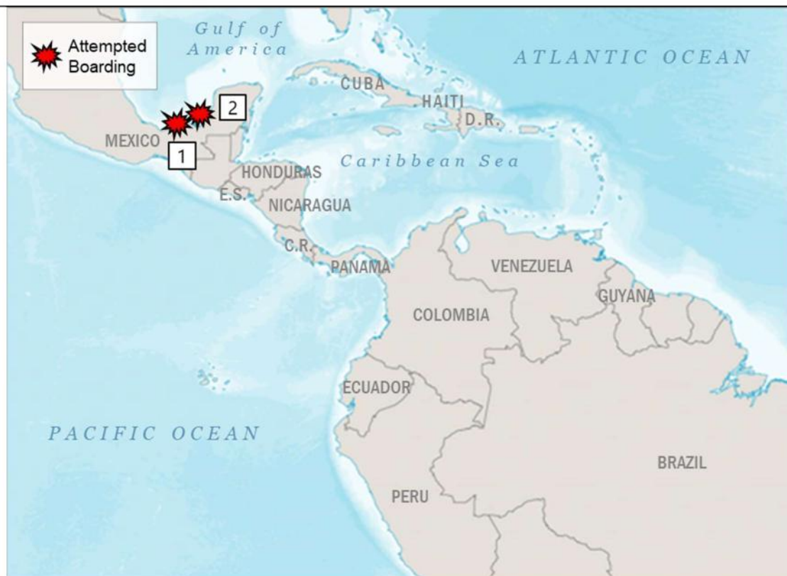
(U) Figure 1. Piracy and Armed Robbery at Sea in the Gulf of America