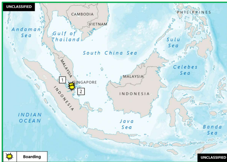
(U) Figure 3. East Asia – Southeast Asia Piracy and Armed Robbery at Sea

1. (U) INDONESIA: On 31 March, four robbers boarded a barge under tow by a tug near Tanjung Balai Karimun in the eastbound lane of the Singapore Strait Traffic Separation Scheme (TSS) (exact position and time not specified). An Indonesian Navy First Fleet quick response team responded to the incident, apprehended the robbers, and recovered ship's stores from the barge. The robbers and evidence were brought to Tanjung Balai Karimun Naval Base for further investigation. (Clearwater Dynamics)