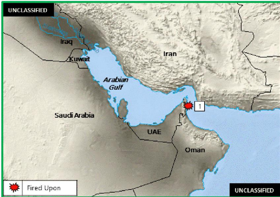
Figure 1. Arabian Gulf Piracy and Maritime Crime

1. (U) UNITED ARAB EMIRATES: On 13 April, the Israeli-owned, Bahamas-flagged vehicle carrier HYPERION RAY reportedly was attacked 18 NM east of Fujairah, UAE, near position 25:11N – 056:41E. ( www.jpost.com ; Clearwater Dynamics)