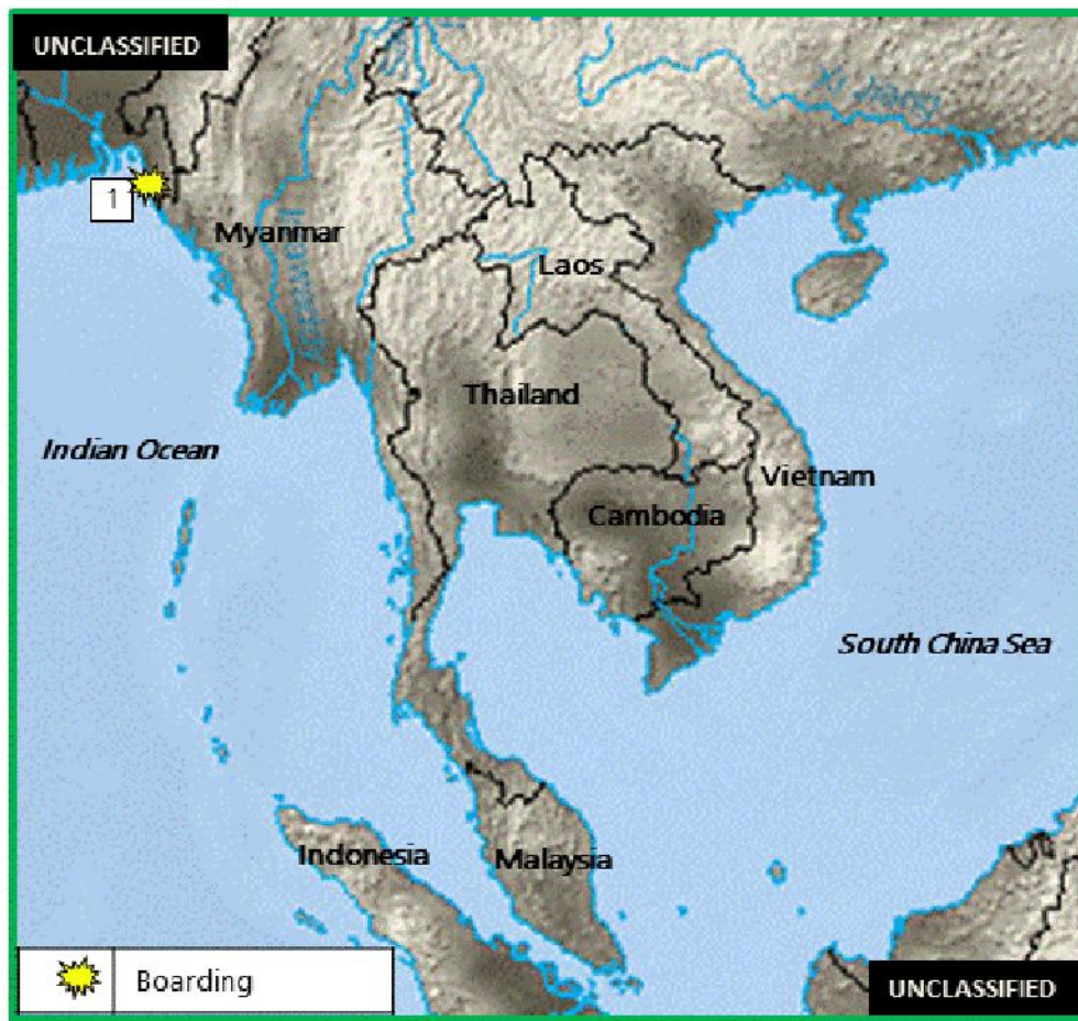
Figure 4. Indian Subcontinent Piracy and Maritime Crime

1. (U) BANGLADESH: On 27 April, Bangladesh Coast Guard personnel rescued 30 Rohingya refugees adrift in the Bay of Bengal for two days following a pirate attack. A Bangladesh Coast Guard spokesman stated that the boat departed from near the camps in Bangladesh's Cox's Bazar district on 23 April, carrying 20 women, 5 men and 5 children. According to the spokesman, pirates attacked the boat on 25 April, taking all valuables from the refugees and crippling the boat's engine before leaving. ( www.channelnewsasia.com )