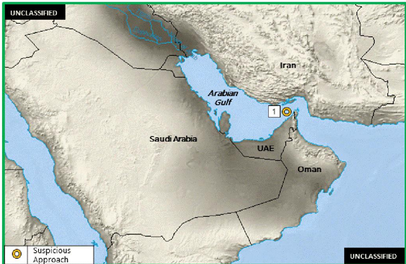
Figure 2. Arabian Gulf Piracy and Maritime Crime