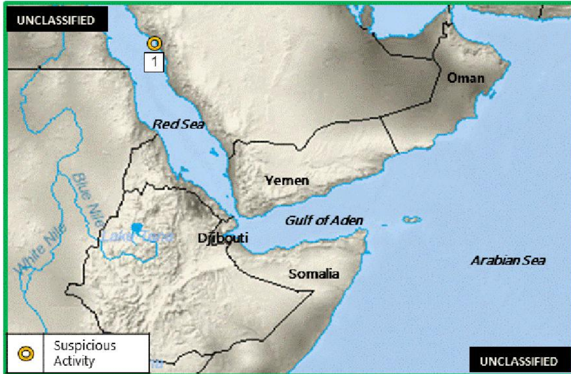
Figure 3. Indian Ocean – East Africa – Red Sea Piracy and Maritime Crime

1. (U) RED SEA: On 27 April, Saudi forces reported that a bomb boat had been intercepted and destroyed near the port of Yanbu. The spokesman for the Saudi Ministry of Defense said that Saudi marine units had destroyed a "remotely piloted and booby-trapped boat" in the Red Sea near Yanbu. United Kingdom Maritime Trade Operations (UKMTO) said in a brief statement that it was aware of reports of an incident about two nautical miles off Yanbu and was investigating, but did not provide further details. (UKMTO; Clearwater Dynamics; www.maritime-executive.com; www.english.alaraby.co.uk/english)