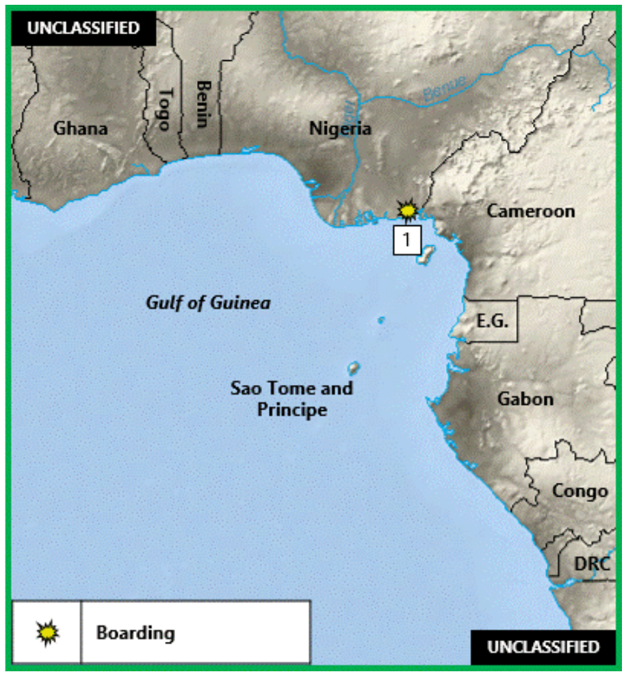
Figure 2. West Africa Piracy and Maritime Crime