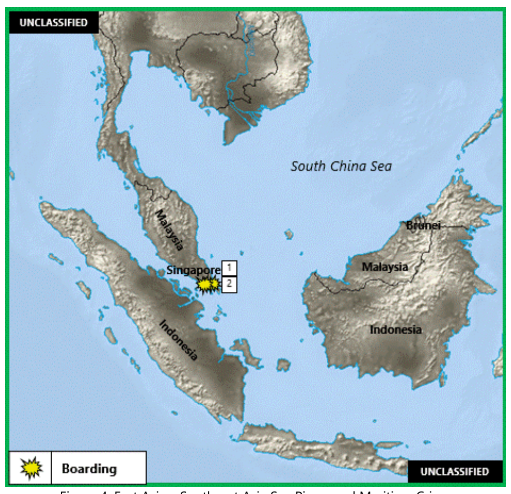
Figure 4. East Asia – Southeast Asia Sea Piracy and Maritime Crime

1. (U) SINGAPORE STRAIT: On 10 October, two robbers boarded a bulk carrier underway in the eastbound lane of the Singapore Strait Traffic Separation Scheme, near position 01:15N - 104:11E. After the robbers were seen in the engine room, the chief engineer was informed, and he then notified the bridge. The robbers escaped after the alarm was raised and the crew mustered. A search of the ship was carried out and nothing was reported missing. (IMB; Clearwater Dynamics)