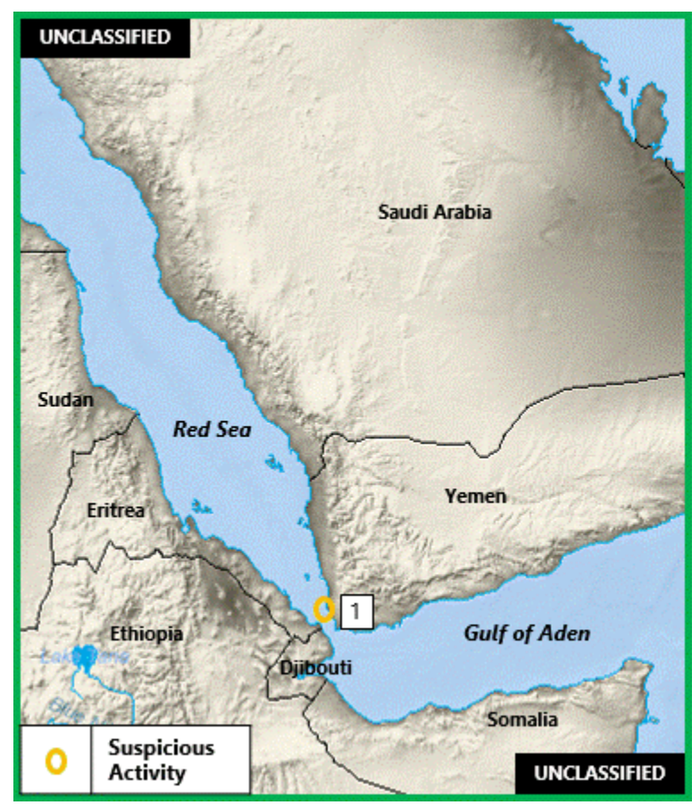
Figure 3. Indian Ocean – East Africa – Red Sea Piracy and Maritime Crime

1. (U) RED SEA: On 4 October, the Singapore-flagged tanker KHK EMPRESS reported a suspicious approach by one skiff in the Bab el Mendeb Strait, near position 13:06N – 043:07E. It was reported that there were eight to nine persons on the skiff and no boarding equipment or weapons could be seen. In response, the tanker increased speed and the onboard armed security team manned the bridge of the ship. (ReCAAP)