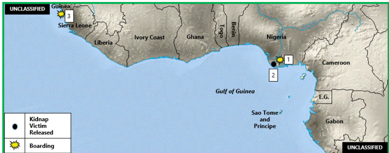
Figure 2. West Africa Piracy and Maritime Crime

1. (U) SPAIN: On 26 October, activists from an international environmental organization blocked the port of Valencia to protest the arrival of the Marshall Islands-flagged LNG tanker MERCHANT, carrying a cargo of natural gas from the United States. (www.maritime-executive.com)