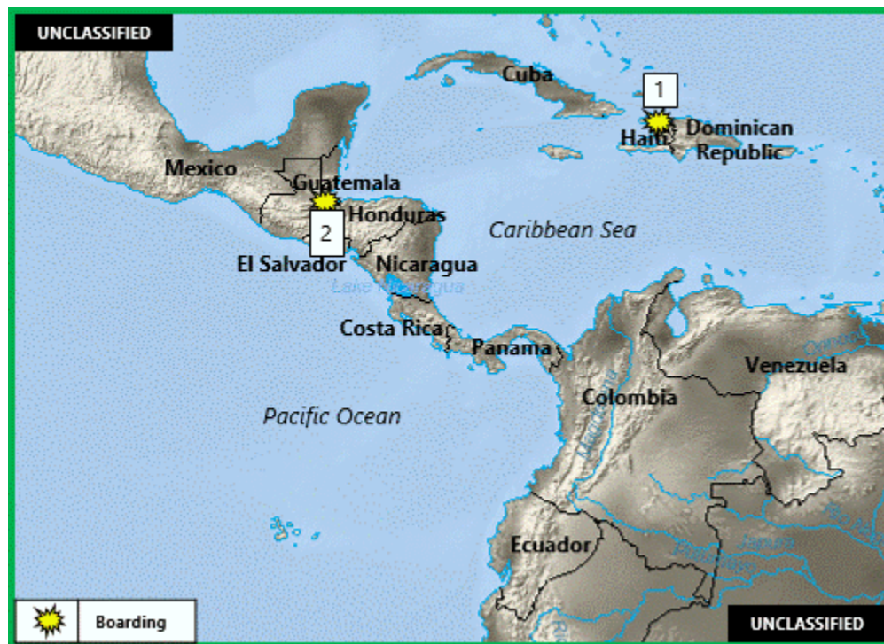
Figure 1. Central America – Caribbean – South America Piracy and Maritime Crime

B. (U) CENTRAL AMERICA – CARIBBEAN – SOUTH AMERICA: