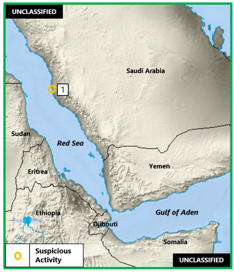
Figure 2. Indian Ocean – East Africa – Red Sea Piracy and Maritime Crime

1. (U) SAUDI ARABIA: On 2 November, authorities in the Port of Jeddah announced the seizure of 1.78 million Captagon tablets hidden in a shipping container manifested as carrying spices and legumes. (BBC)